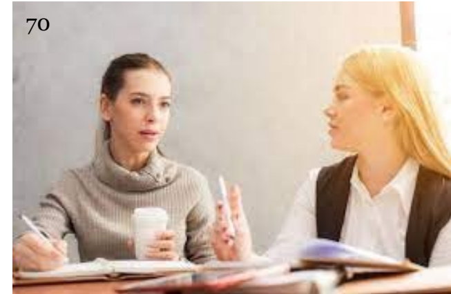
70 Encouraging Questions

None of the above questions can be answered simply , but stimulate open discussion and consideration of different ideas and approaches.