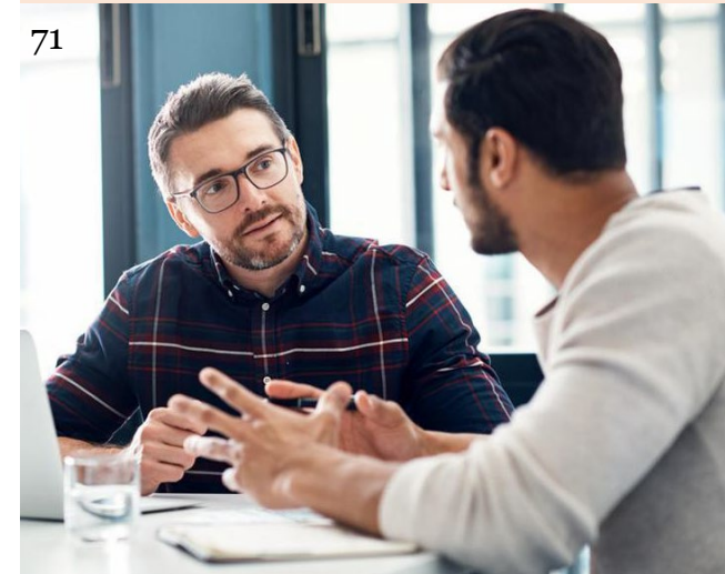
71 A most appropriate venue to ask questions is when a leader provides feedback to employees.